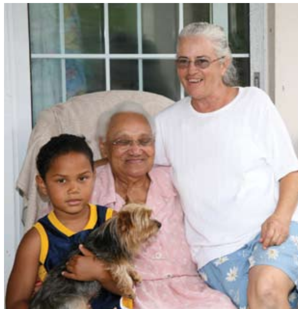
At the 2000 census 11% of the population was aged over 65, and over a third of persons with disabling conditions were seniors

Seniors can benefit tremendously from health promotion interventions. Therefore, this goal focuses on promoting health and improved quality of life through screenings, activity and support