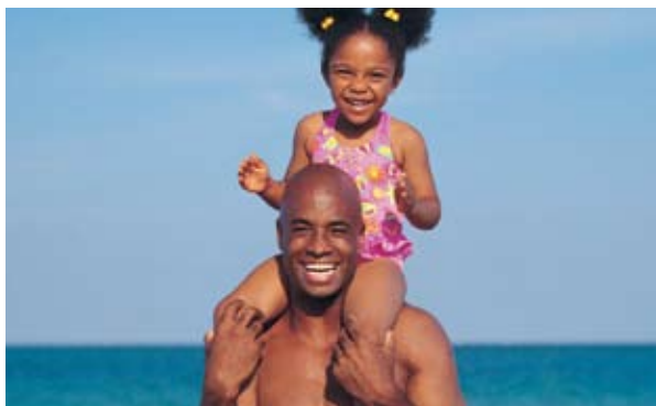
The majority of Bermuda residents live in family units; even people who live independently have family ties that play a part in their ordinary lives

In Bermuda 66% of all households can be said to be family households (25% two-parent, 20% adult couple, 11% one parent, and 10% extended family), while 28% are one person households, and 6% are households of unrelated persons 44 . In 2004 the average weekly household income for Bermuda was $2,043; however