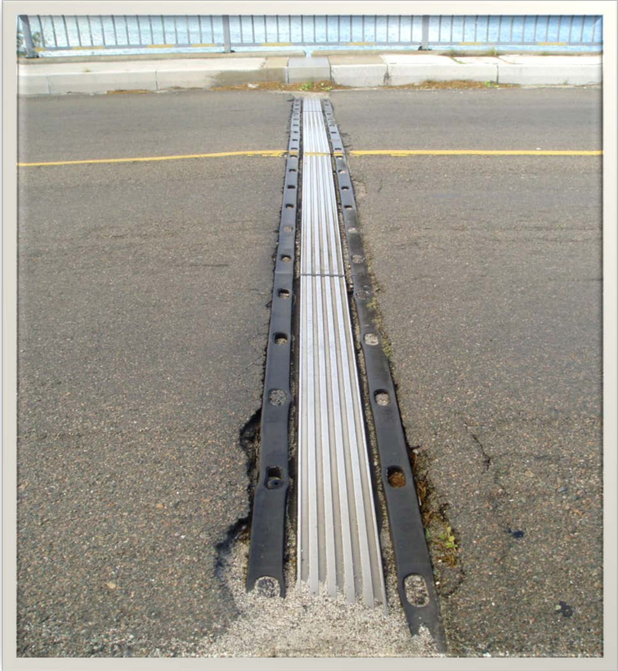
Figure 5: South Expansion Joint