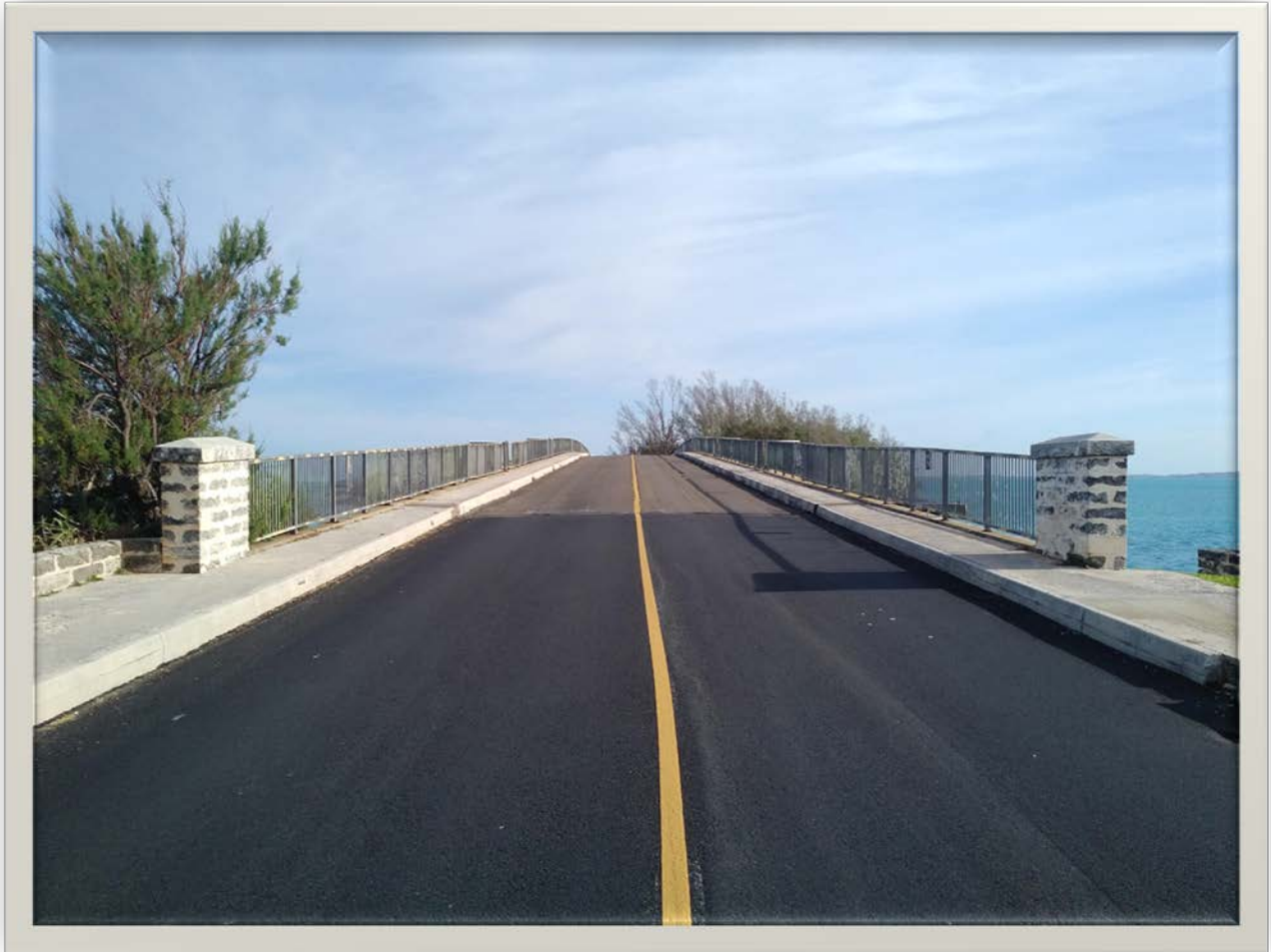
Figure 1 : Watford Bridge Looking North