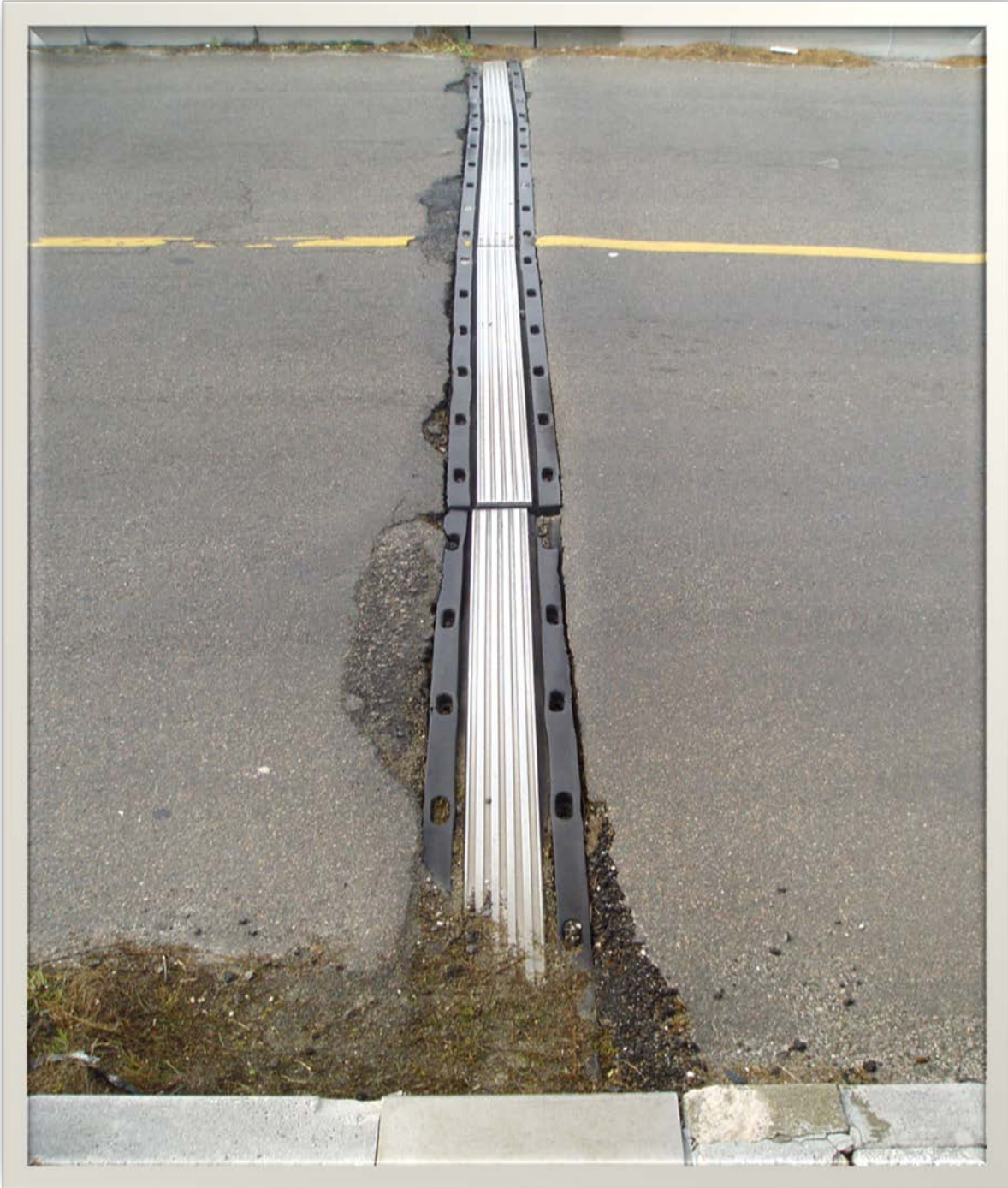
Figure 4: North Expansion Joint