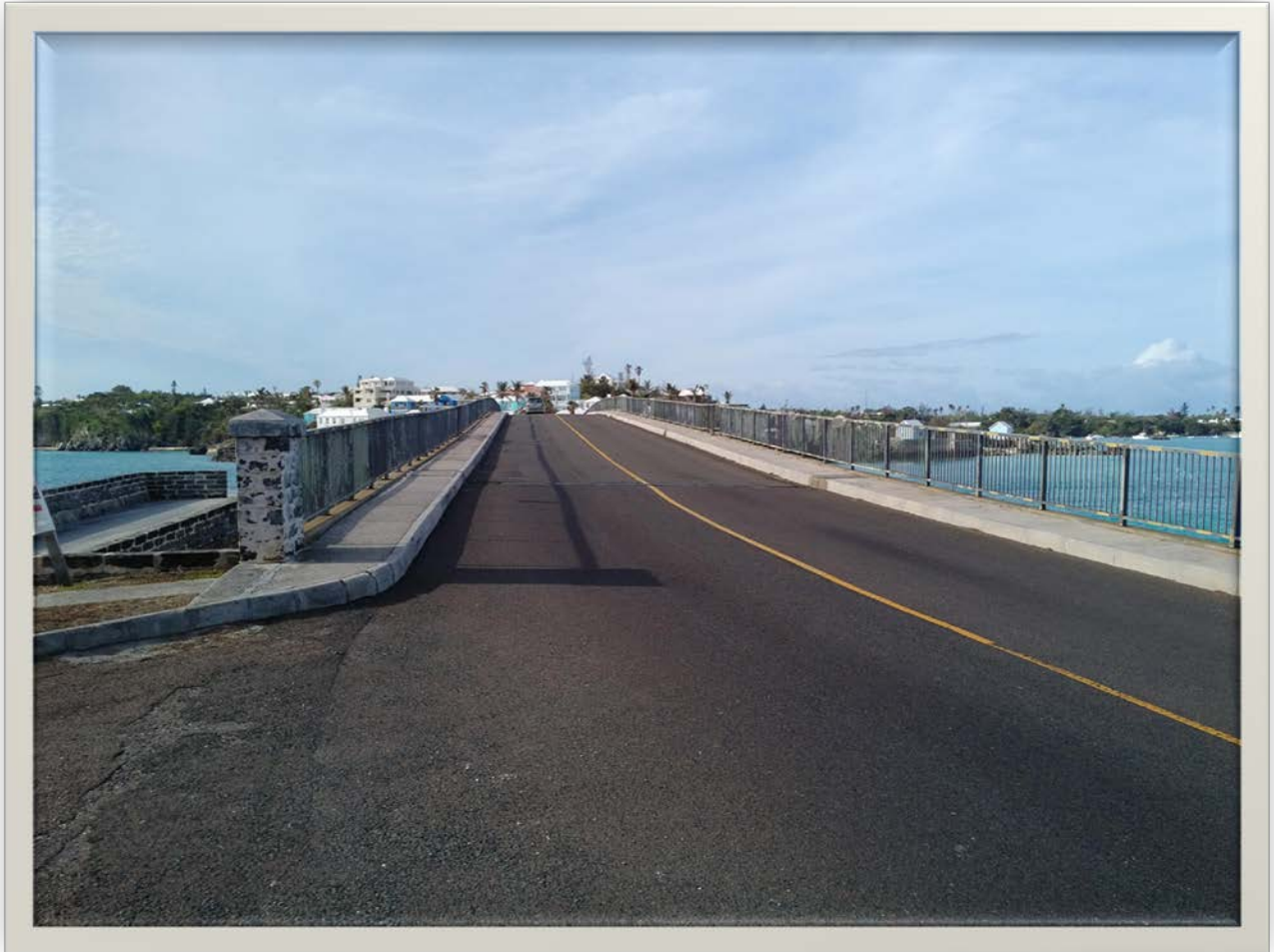
Figure 2: Watford Bridge Looking South