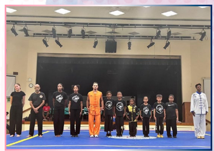
Wushu Open Taolu Competitors