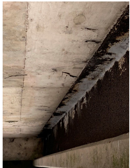
Photograph 4 – Corrosion of girders