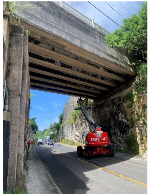
Photograph 8 – West facing view