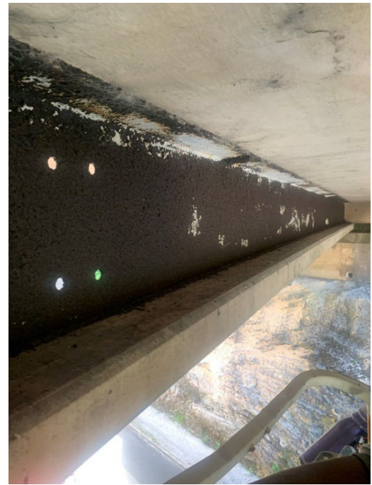
Photograph 6 – Corrosion of girders