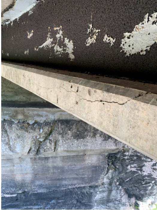
Photograph 5 – Corrosion of girders