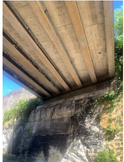
Photograph 2 – Bridge Soffit