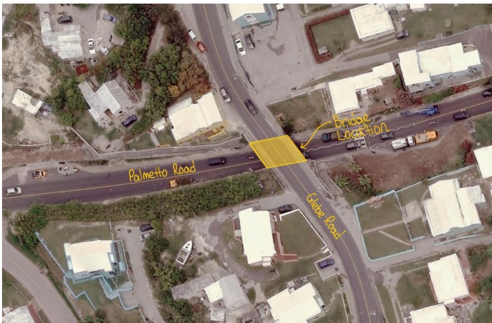
Figure 1. Glebe Road Overpass Location Plan