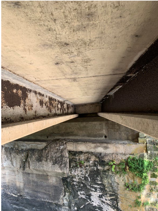
Photograph 1 – Corrosion of girders