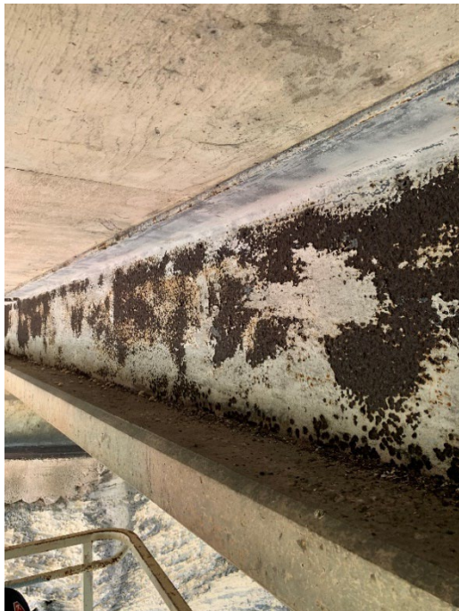
Photograph 7 – Corrosion of girders