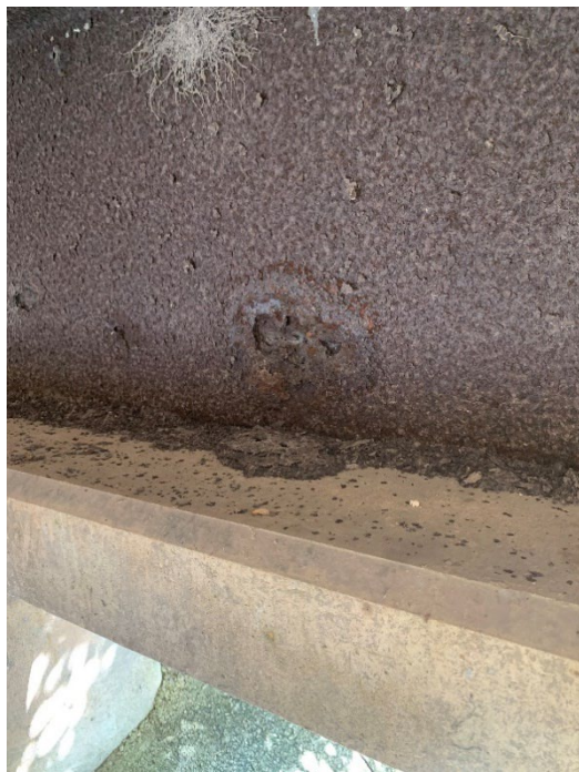
Photograph 3 – Corrosion of girders