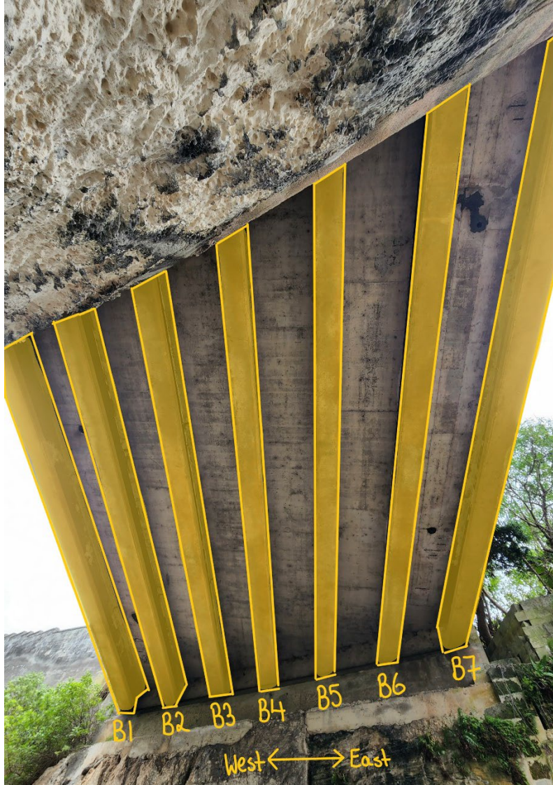
Figure 2. View of Glebe Road Overpass Bridge Soffit. Showing Beams to Be Recoated.