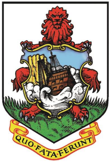
Ministry of Public Works